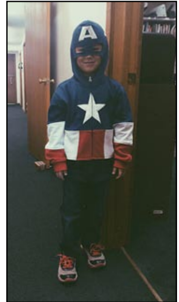
Captain America had a lesson at the Wichita Music Academy in October!

Thank you for another great year at Garten's Music & the Wichita Music Academy! We hope you have a safe and happy Thanksgiving!