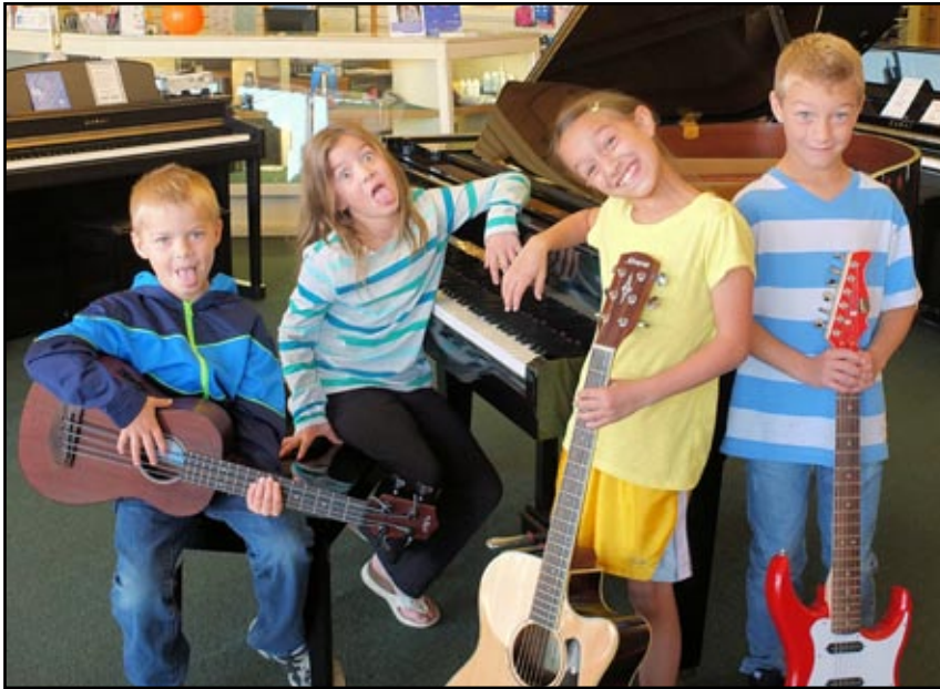
The kids clown around during a break in lessons at the Wichita Music Academy.