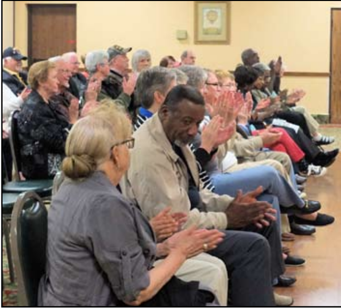
Lowrey students enjoy the concert.